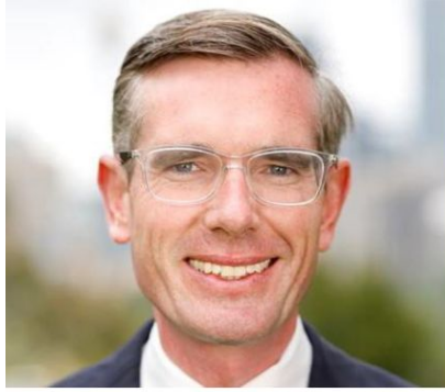
Dominic Perrottet MP Premier of New South Wales